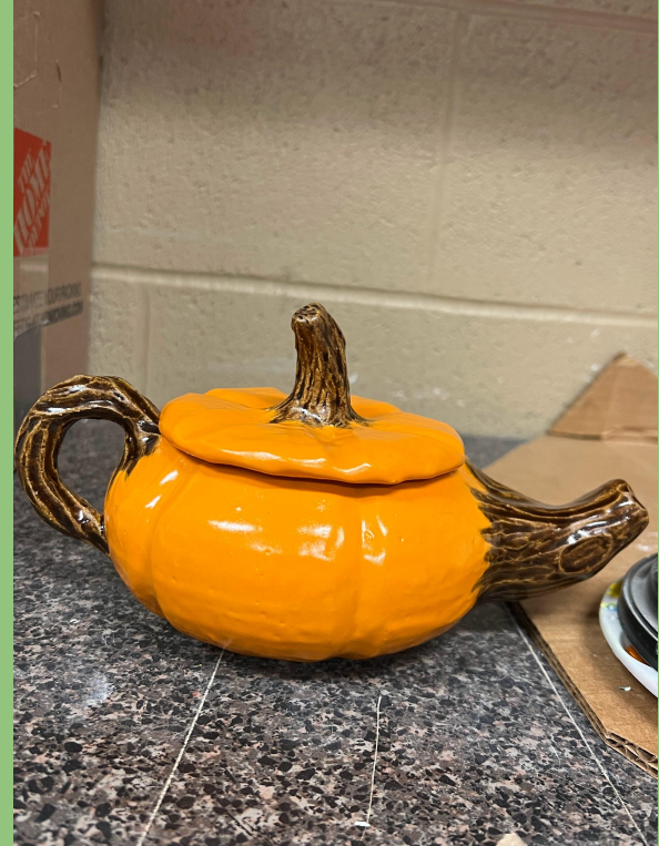
Casey's pumpkin teapot.